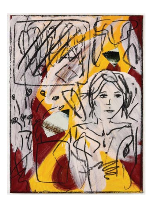
Sofia Silva The Paduan Painter 2017 Oil and charcoal on canvas 40 x 30 cm

All images: © Werner Büttner Courtesy of Marlborough Fine Art