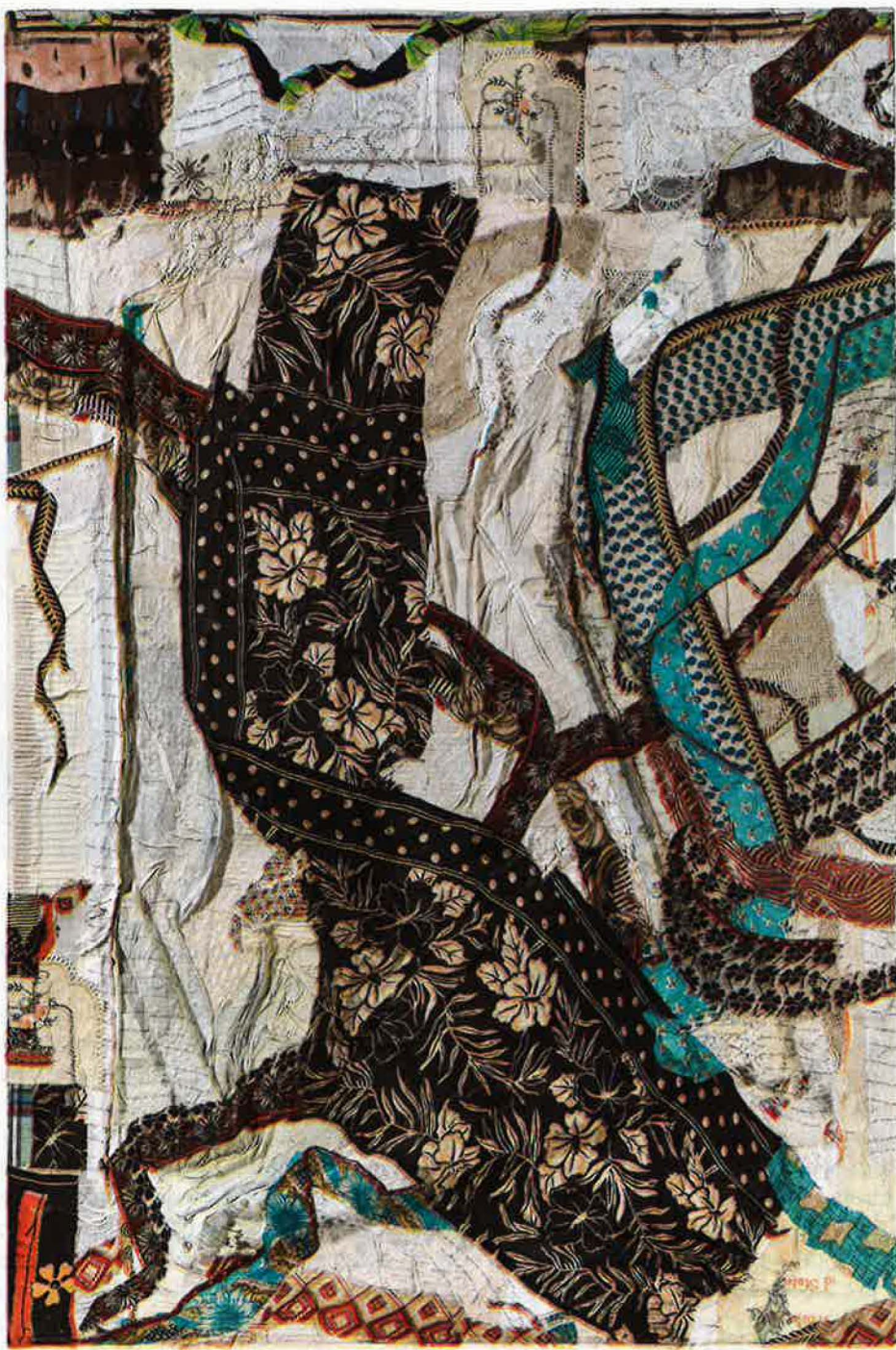
these as works of uncovering," he said. "I'm trying to do justice to my feeling of what the mind is like—it's sedimentary."

Indian Ocean. He walked to school wearing a safari suit and sandals. In the street, he passed Zulu men carrying shields and walking sticks; bare-chested African women with loads on their heads; Europeans in Western dress; Indian women in saris; black men in prison garb, laboring at the roadside with pickaxes. Sacks was on the "white" side of the color line; his ancestors, Lithuanian Jews, had come to South Africa toward the end of the nineteenth century. Still, the government included Nazi sympa-