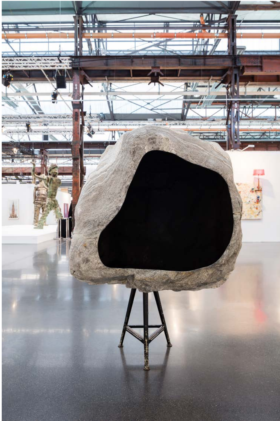
Julius von Bismarck Boulder IV , 2017 View 2