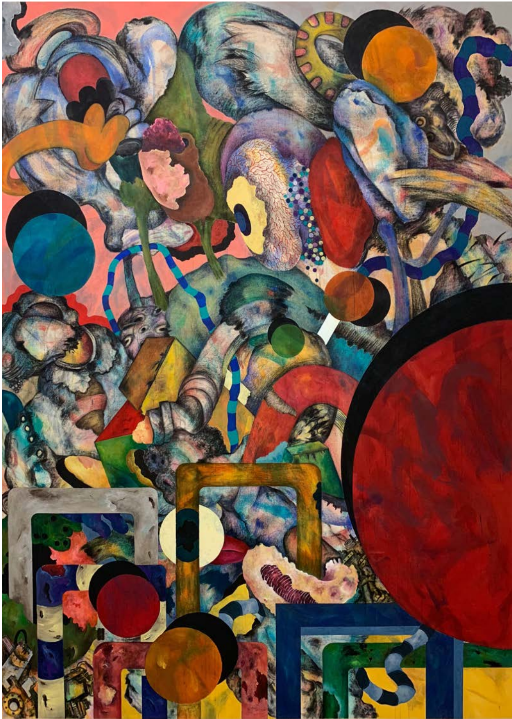
Ahmed Alsoudani Party , 2018 acrylic, charcoal, color pencil on canvas 88 x 64 in. / 223.5 x 162.6 cm