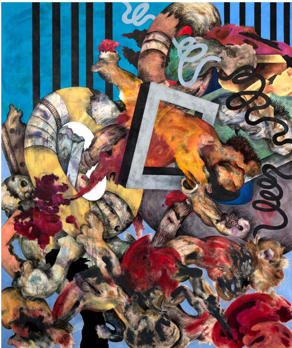
Ahmed Alsoudani Ocean , 2018 acrylic, charcoal, color pencil on canvas 76 x 64 in. / 193 x 162.6 cm