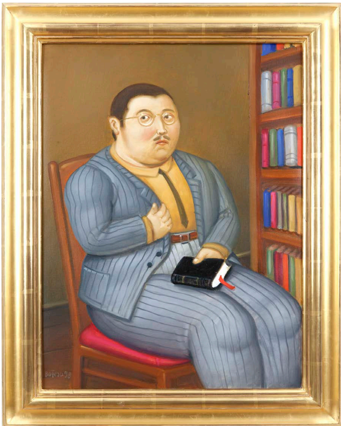
Fernando Botero Man with Book , 1998 oil on canvas 21 x 16 1/8 in. / 53.34 x 41 cm