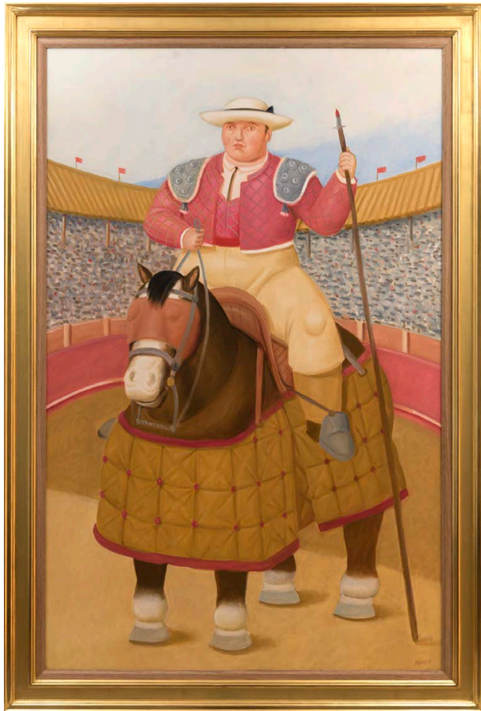
Fernando Botero Picador , 2018 oil on canvas 60 5/8 x 39 1/4 in. / 154 x 100 cm