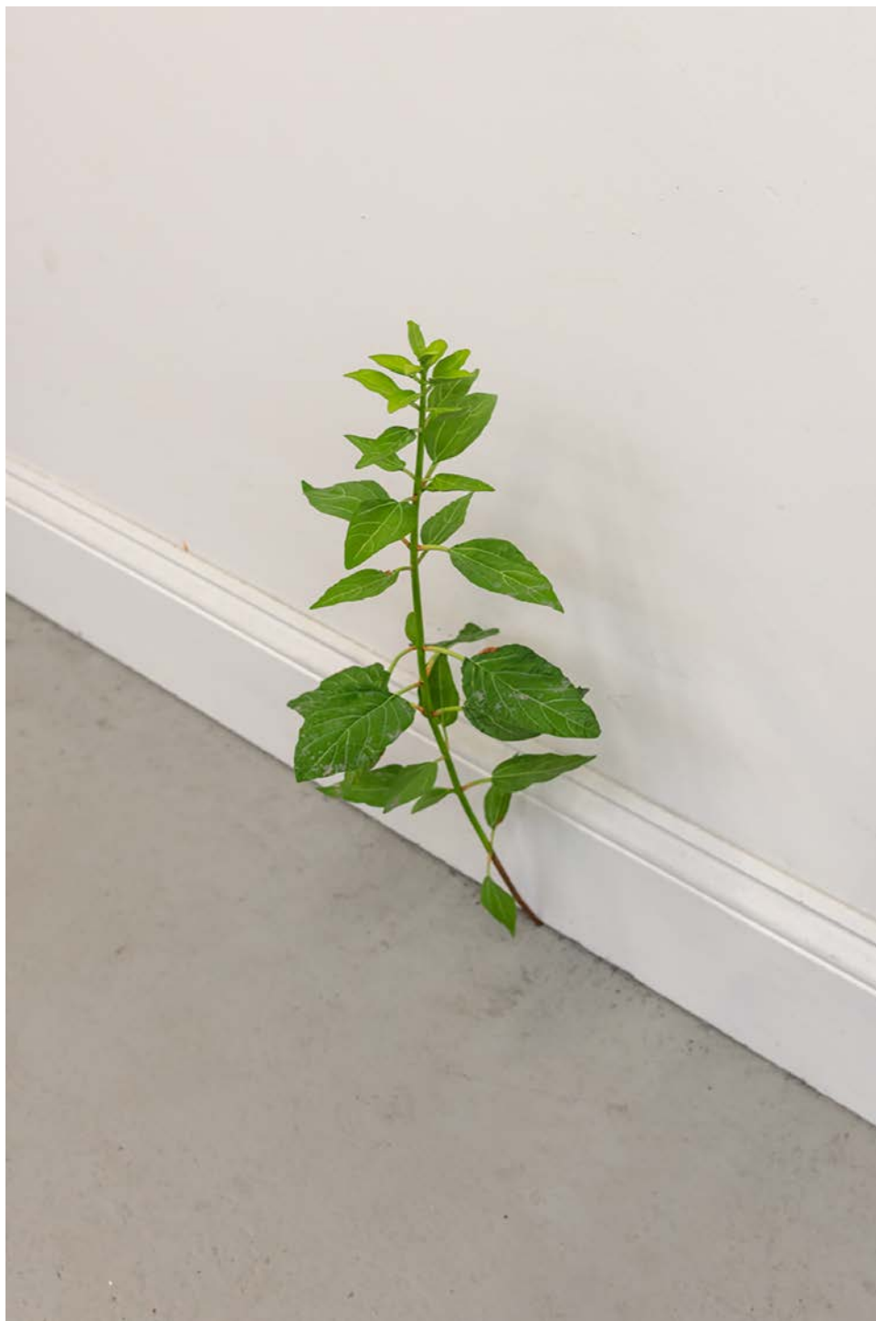
Tony Matelli Weed #463, 2019 painted bronze 19 x 9 1/2 x 9 in. / 48.3 x 24.1 x 22.9 cm