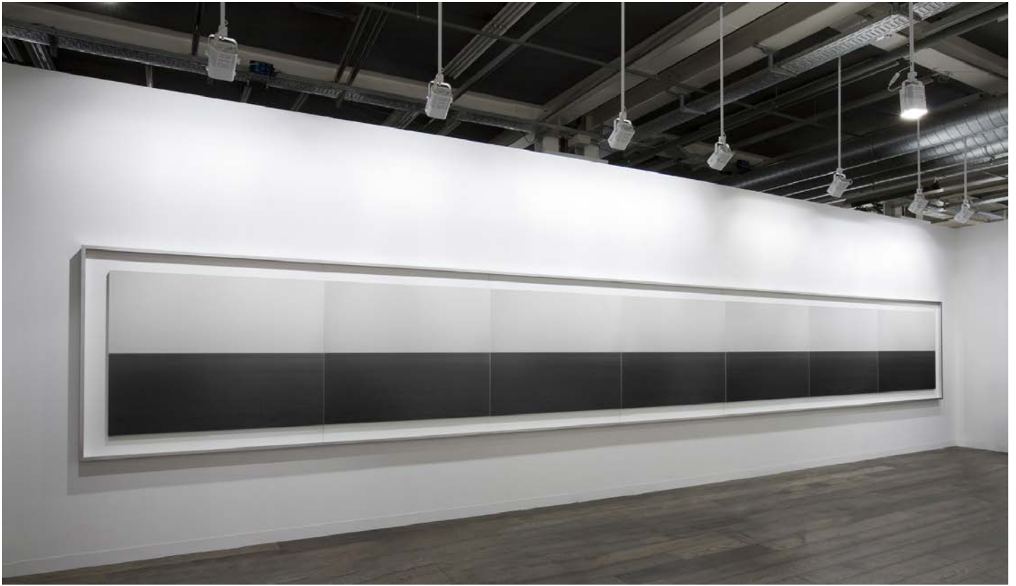
Hiroshi Sugimoto North Pacific Ocean, Okurasaki, 2002 gelatin silver print, seven panels, ed. 1/5 negative numbers: 510, 511, 512, 513, 514, 515 and 516 seven panels, each 47 1/4 x 59 in. / 120 x 150 cm overall framed, 57 1/8 x 422 in. / 147 x 1,072 cm