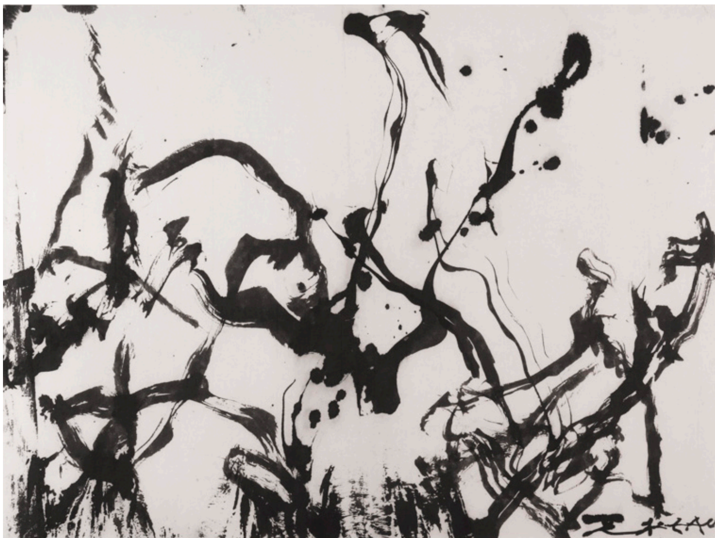
Zao Wou-Ki Untitled , 2005

India ink on rice paper mounted on paper image: 18 1/8 x 24 1/4 in. / 46 x 61.5 cm sheet: 25 3/8 x 31 1/2 in. / 64.5 x 80 cm