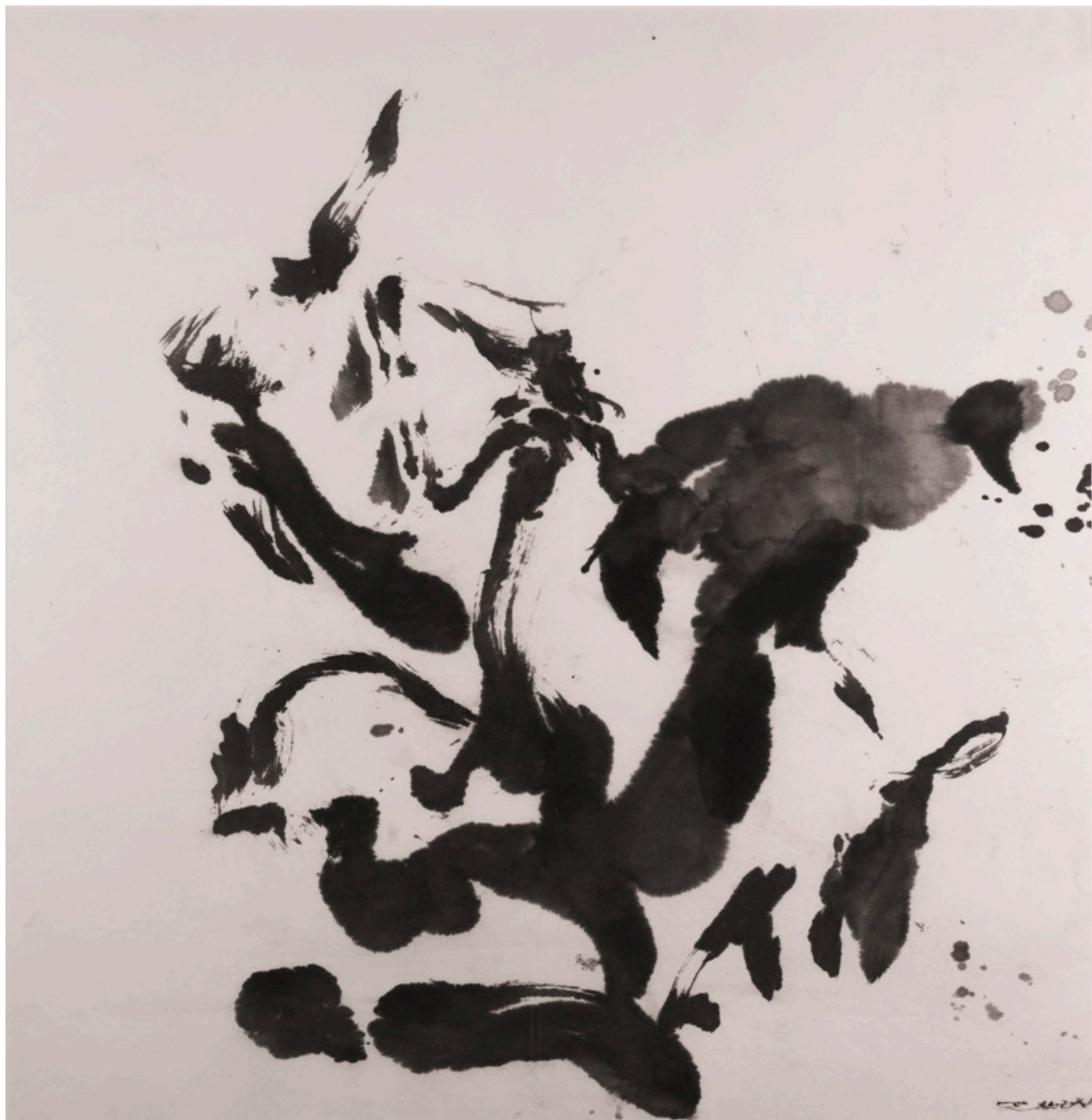
Zao Wou-Ki Untitled , 2006

India ink on rice paper mounted on paper image: 38 1/4 x 37 in. / 97 x 94 cm sheet: 43 3/4 x 42 3/4 in. / 111 x 108.5 cm N 48.174