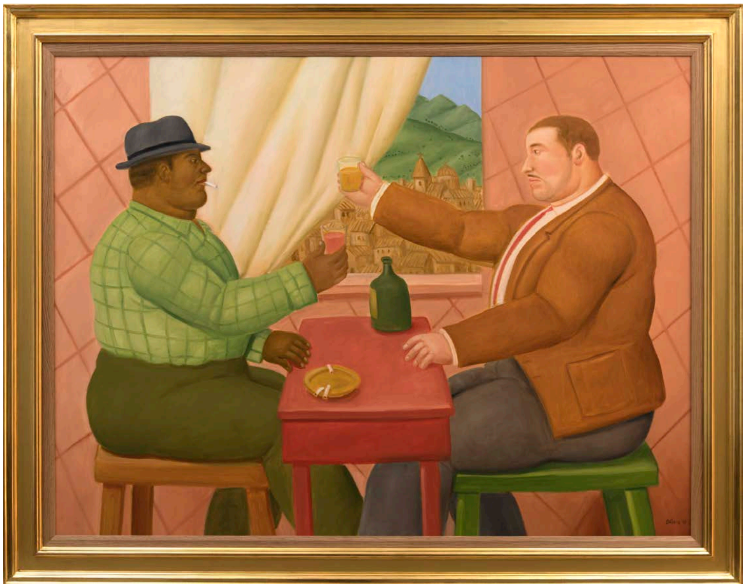
Fernando Botero The Toast , 2018 oil on canvas 39 x 51 1/2 in. / 99 x 131 cm