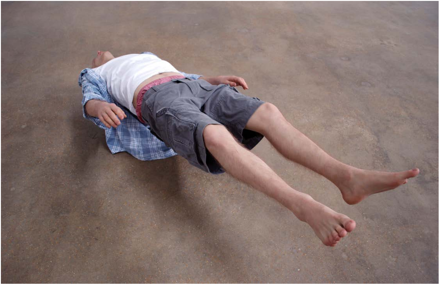
Tony Matelli Josh , 2010 View 2