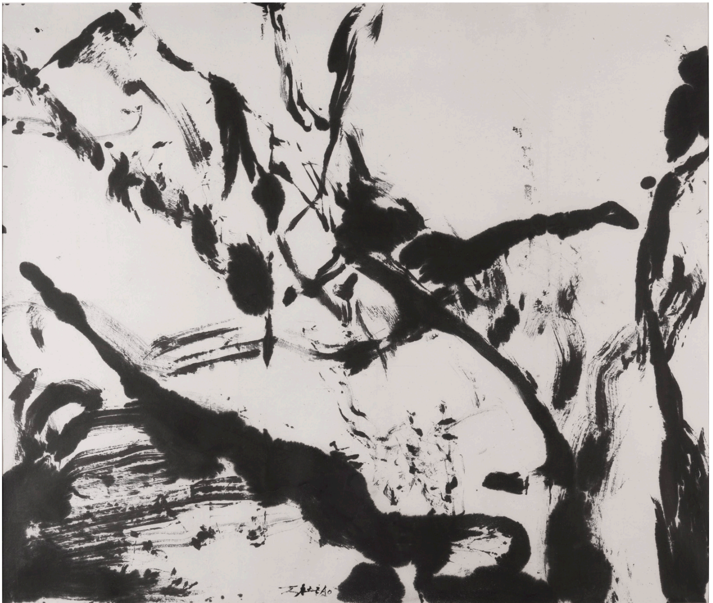
Zao Wou-Ki Untitled , 2005

India ink on rice paper mounted on paper image: 27 3/8 x 32 1/4 in. / 69.5 x 82 cm sheet: 35 x 40 1/8 in. / 89 x 102 cm