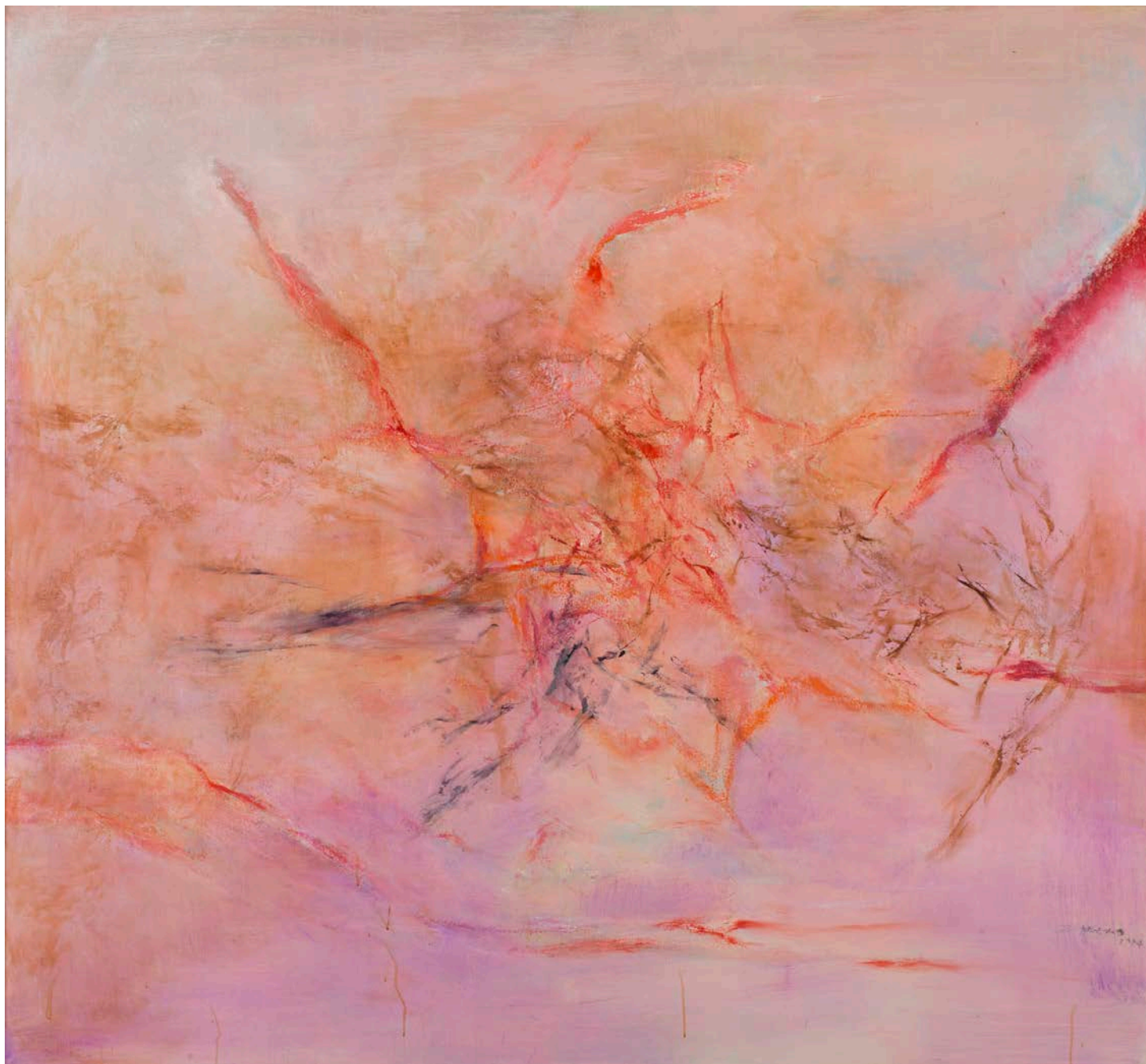
Zao Wou-Ki Vague Rouge-Blanc-Bleu , 2004 oil on canvas 59 x 63 3/4 in. / 150 x 162 cm