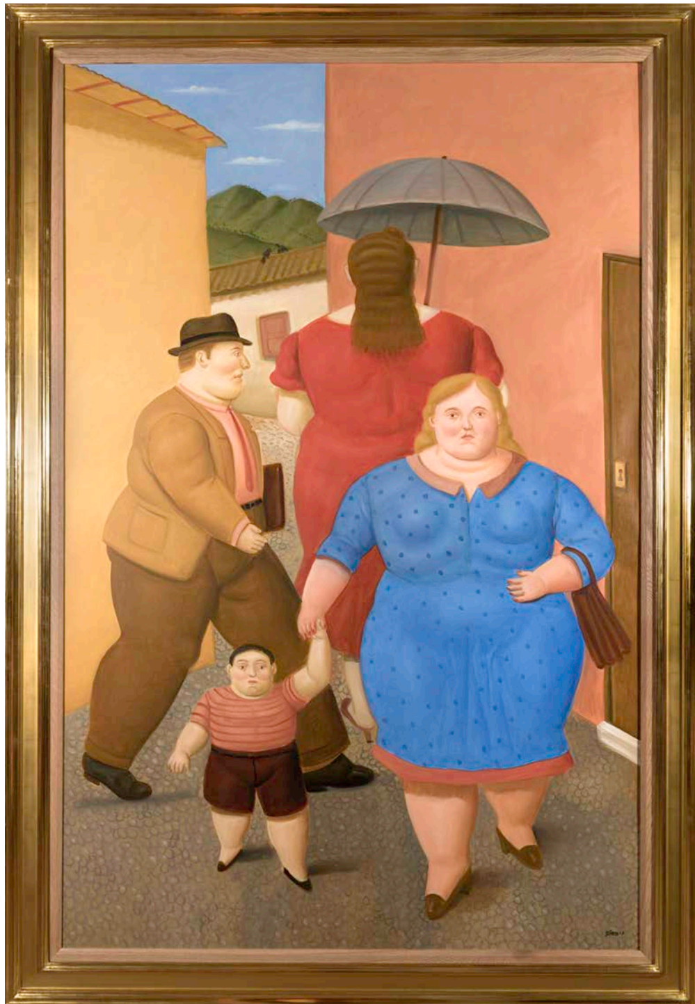
Fernando Botero The Street , 2017 oil on canvas 66 1/8 x 42 1/2 in. / 168 x 108 cm