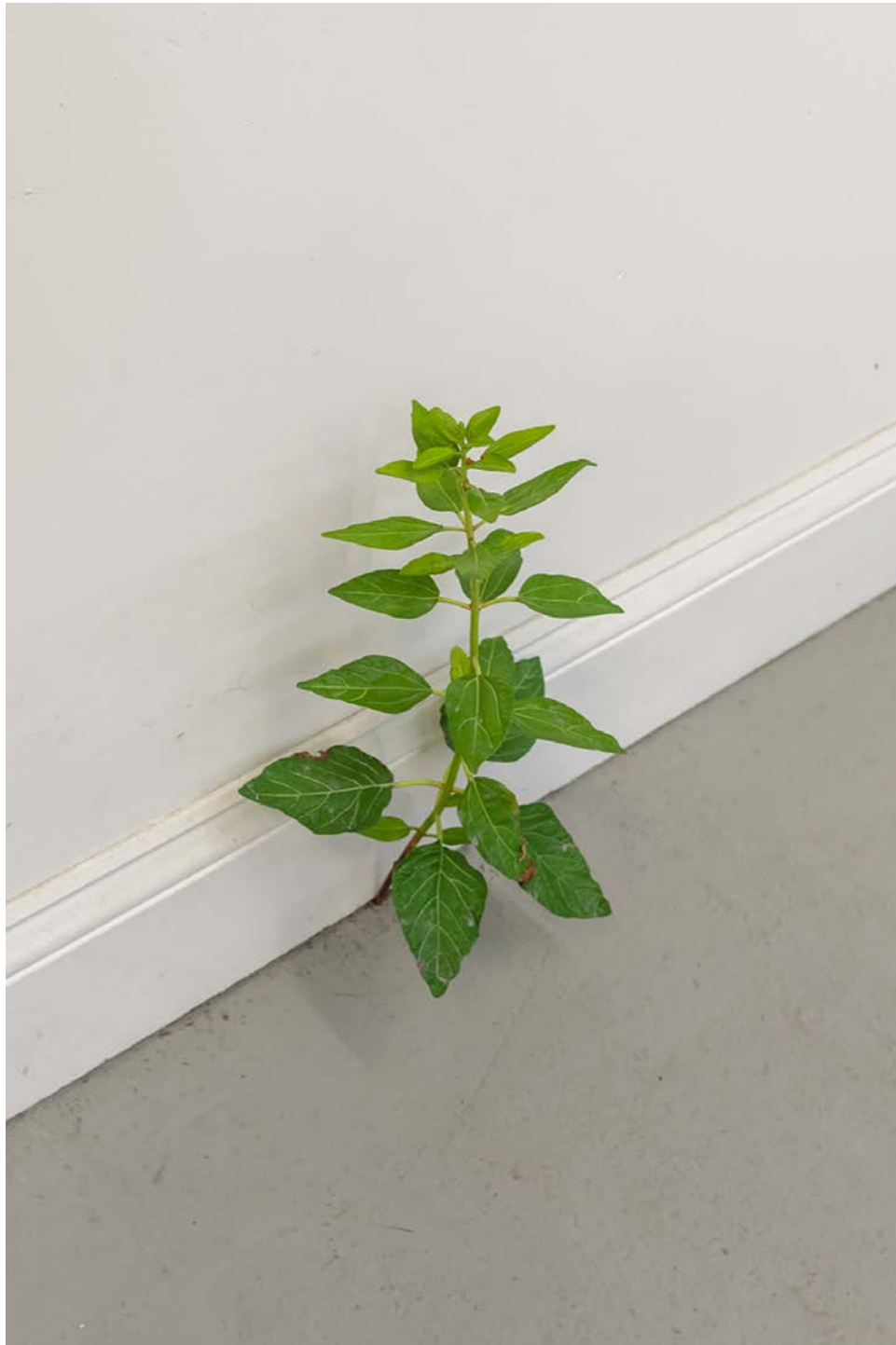
Tony Matelli Weed #465 , 2019 painted bronze 17 x 8 x 7 in. / 43.2 x 20.3 x 17.8 cm