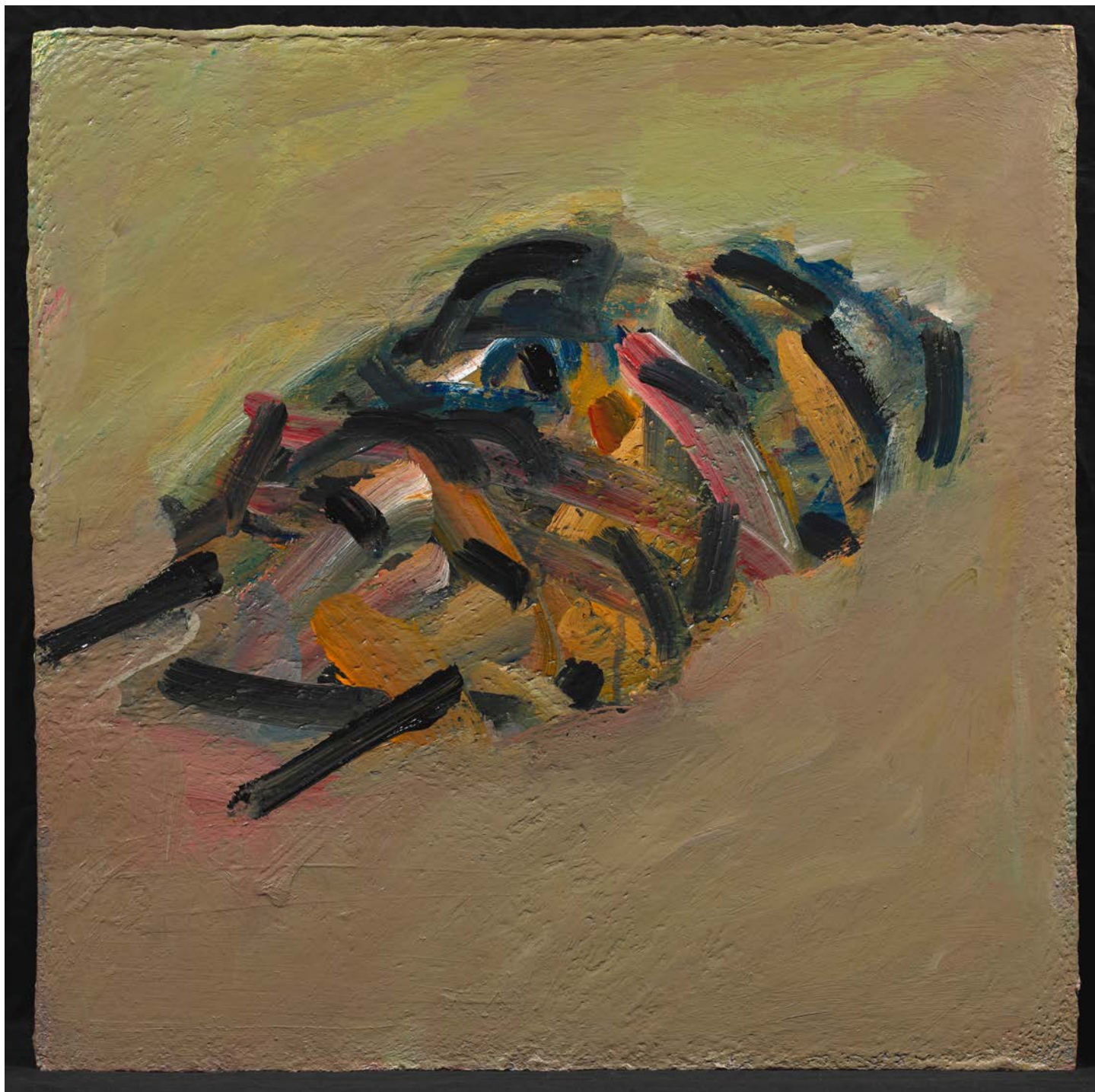
Frank Auerbach Reclining Head of Julia , 2019 acrylic on board 22 1/4 x 22 1/4 in. / 56.5 x 56.5 cm