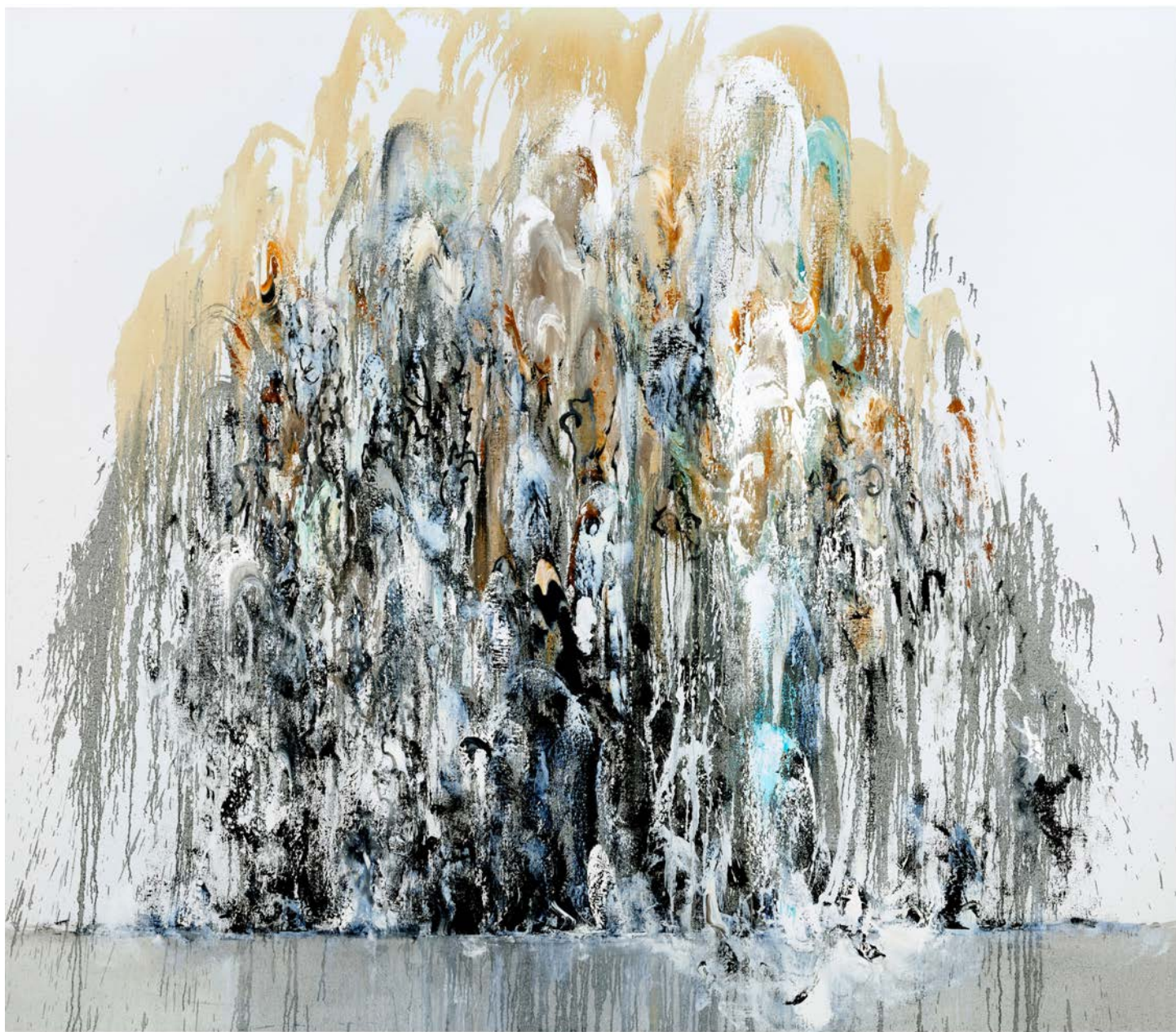
Maggi Hambling Wall of Water I , 2010 oil on canvas 78 x 89 in. / 198.1 x 226.1 cm