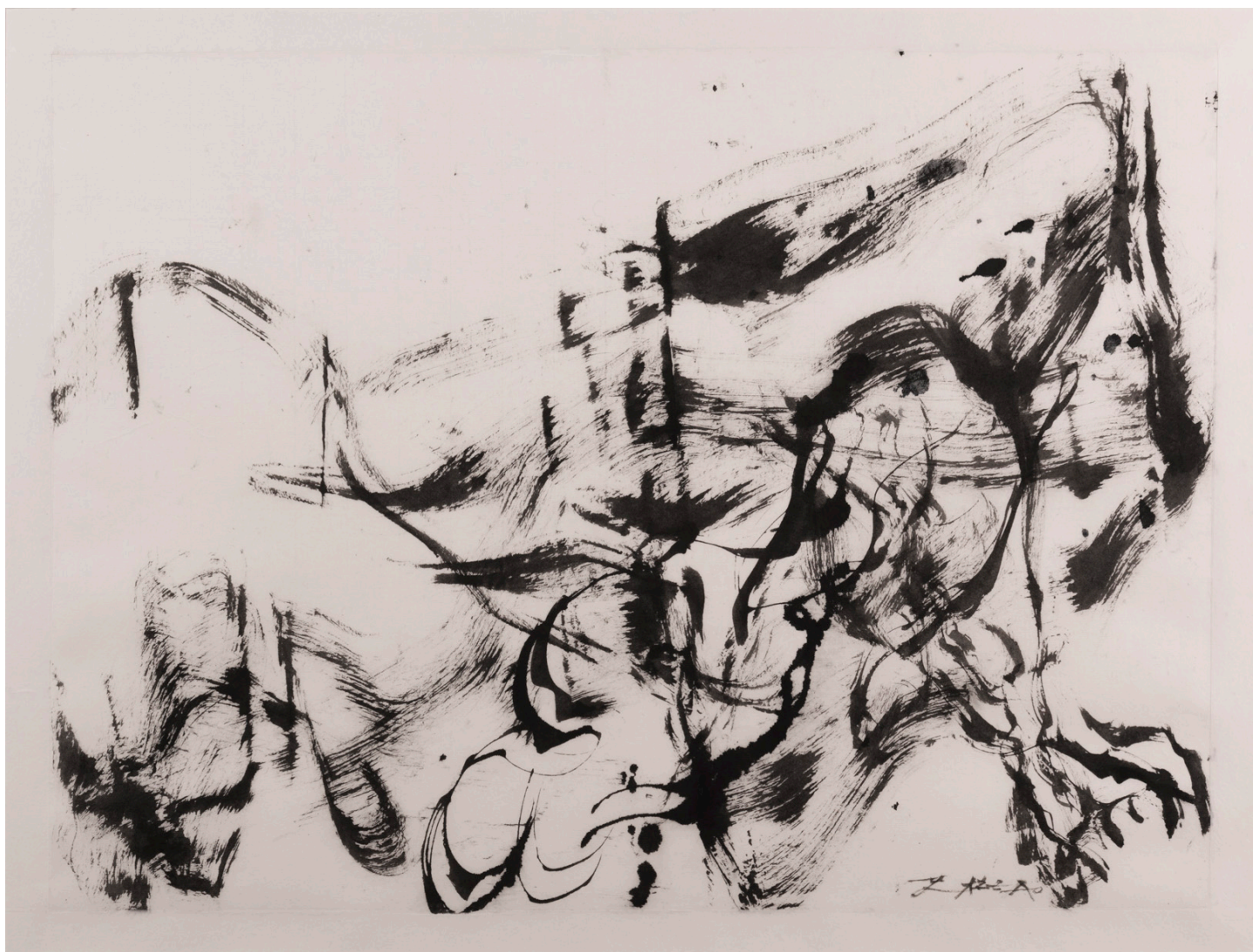
Zao Wou-Ki Untitled , 2005 ink on paper 17 7/8 x 24 1/4 in. / 45.5 x 61.5 cm