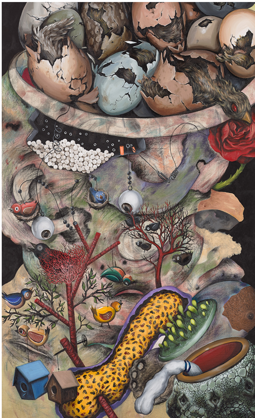
Ahmed Alsoudani Birds , 2015 acrylic, charcoal, color pencil on canvas 85 x 53 in. / 215.9 x 134.62 cm