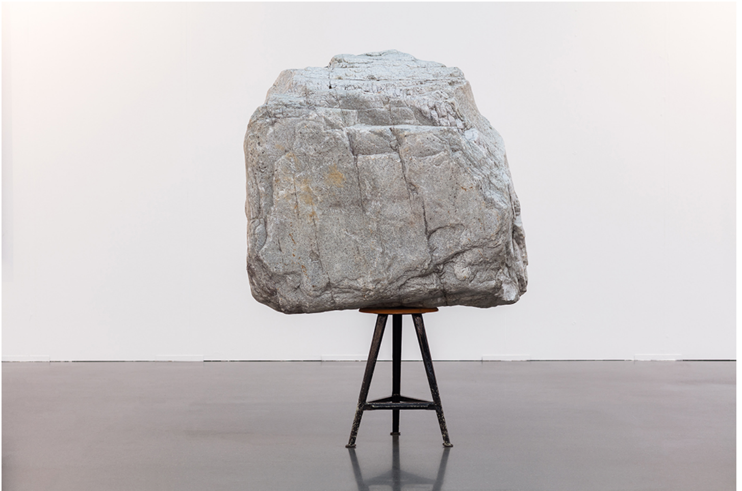
Julius von Bismarck Boulder IV, 2017 hollowed boulder, carbon fibers, sandbag, concrete 51 1/8 x 51 1/8 x 29 1/2 in. / 130 x 130 x 75 cm