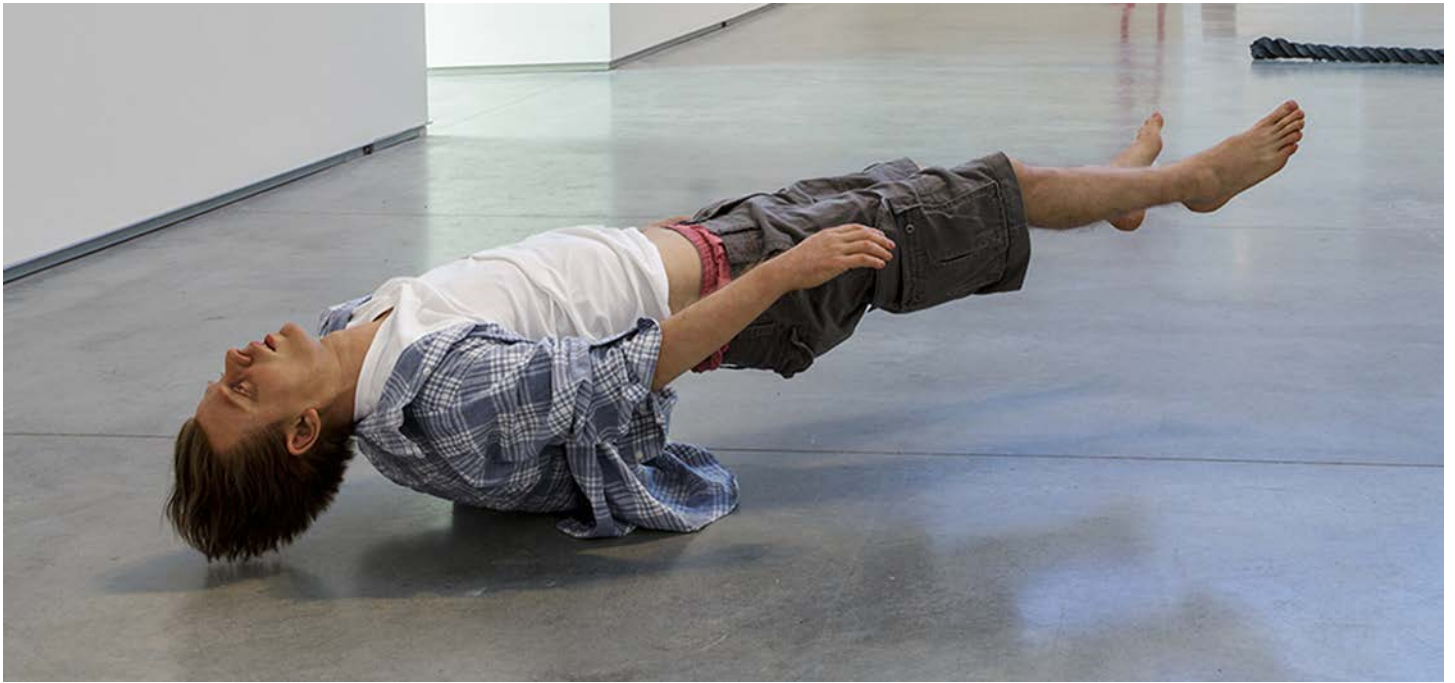
Tony Matelli Josh , 2010 silicone, steel, hair and clothing, AP 21 x 88 x 30 in. / 53.3 x 223.5 x 76.2 cm